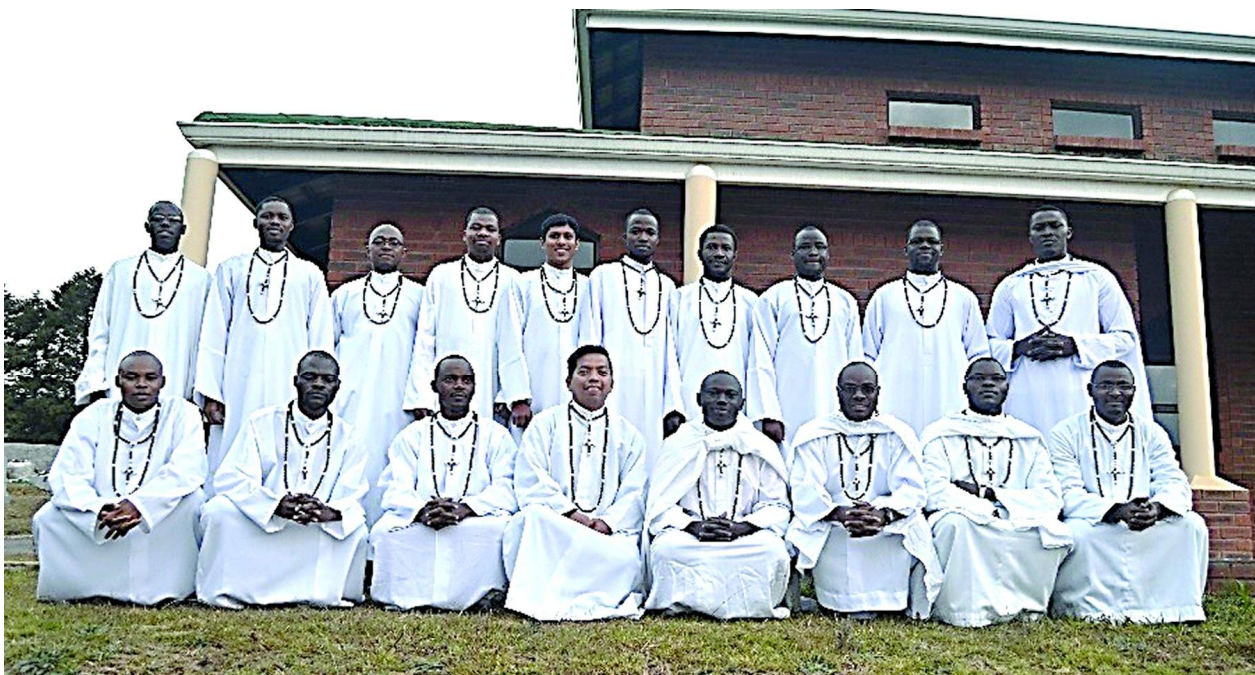
In December of this year those 18 deacons will become priests and receive their first appointment.