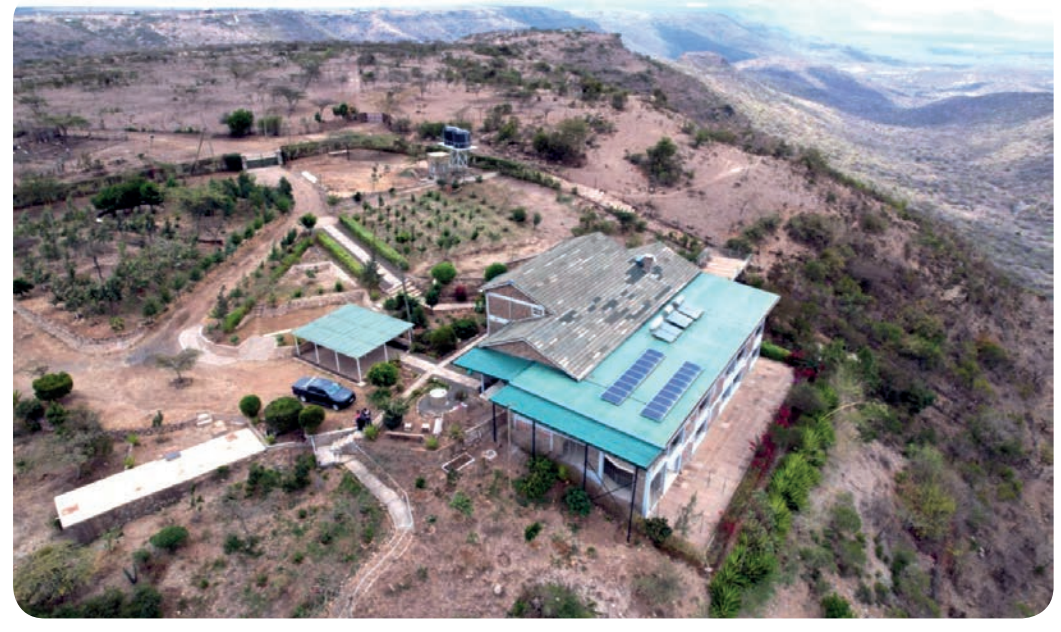
Missionaries of Africa (M.Afr) Bethany Centre in Kenya.