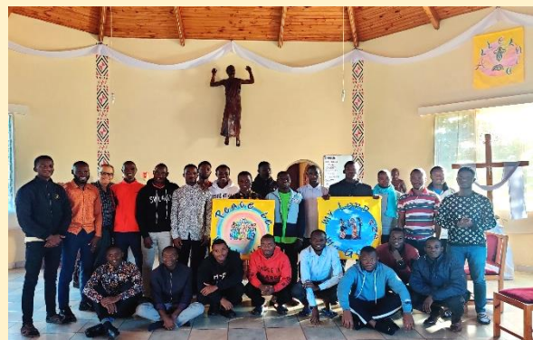
The 24 candidates of Lechaptois Formation House in Malawi.