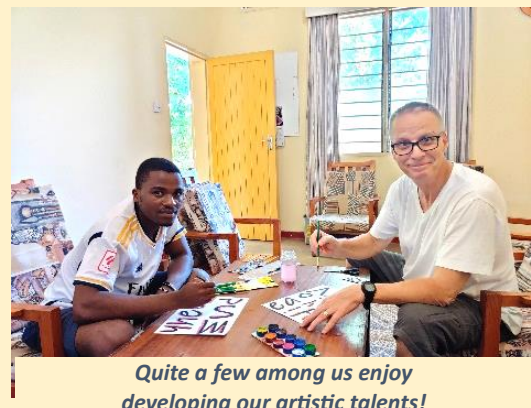
Quite a few among us enjoy developing our artistic talents!

“The harvest is rich, but the labourers are few. Pray to the Lord of the Harvest to send labourers into his harvest.”